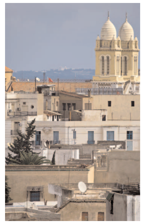
Across the roof tops of Tunis with the steeples of Tunis Cathedral, St Vincent de Paul