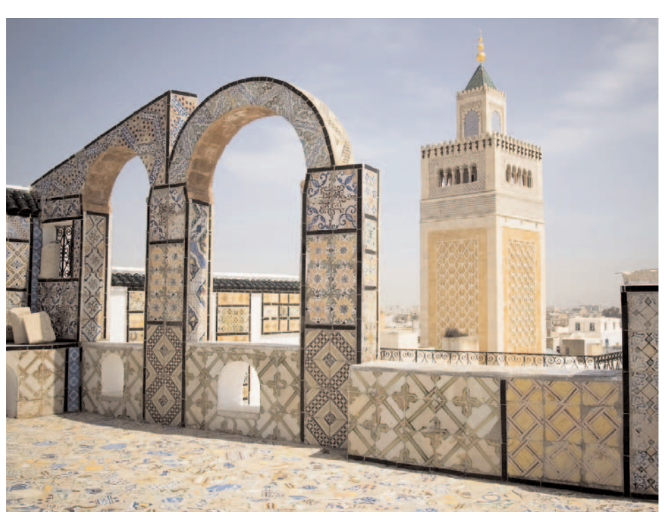
Tunis mosque tower framed with ornamental arch